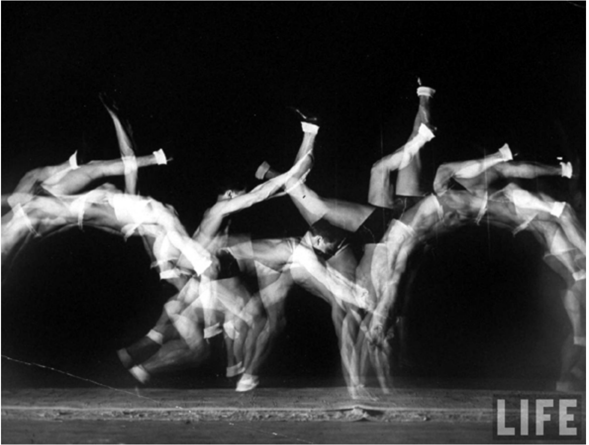
A stroboscopic image of National A.A.U. & Olympic tumbling champion Merrill Rowland "Flip" Wolfe executing series of front handsprings. Copyright Life / Picture taken in New York, NY in 1941 by Gjon Mili.